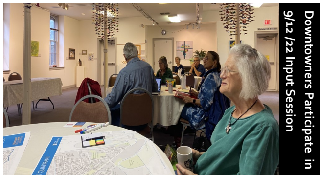
Downtowners Participate in 9/12/22 Input Session

Members of Lancaster Downtowners receive discounts from some special partners. Just mention you are “a Downtowner” when registering or signing up.